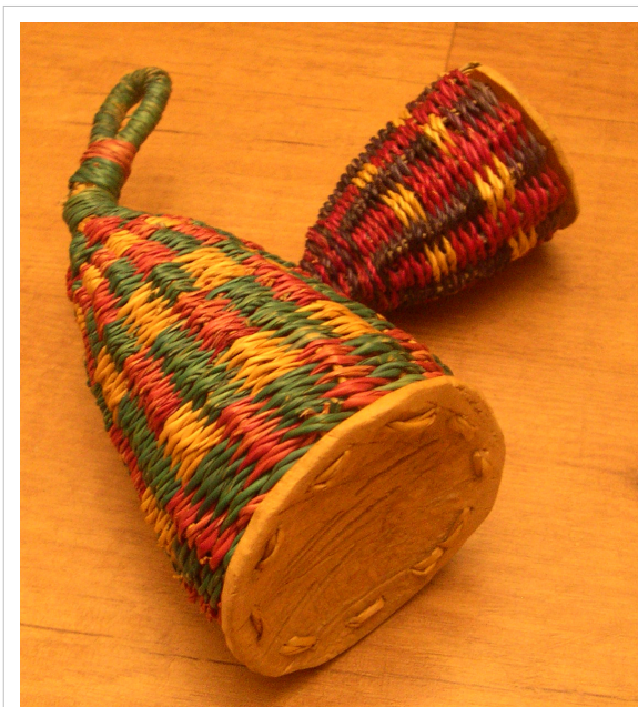
Caxixi from Africa

A shaker (percussion) is any instrument that makes a noise when shaken. Historically they were naturally occurring items such as seed pods. A caxixi is a basketwork shaker with a gourd base. Gourds are used all over the world and covered with a net with shells or seeds to create an instrument such as the shekere. Modern shakers are often cylinders made from metal wood or plastic containing small hard items such as seeds, stones, or plastic - an example is the Egg Shaker. There is another category of shaken instrument using jingles, little discs of metal which tap together when shaken. Tambourines fall into this category.