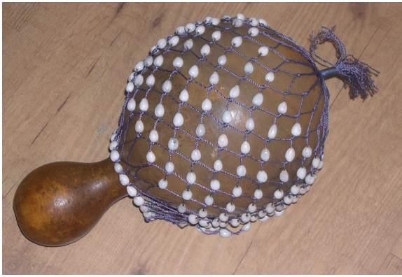
Gourd shekere from Africa with seeds in the net.