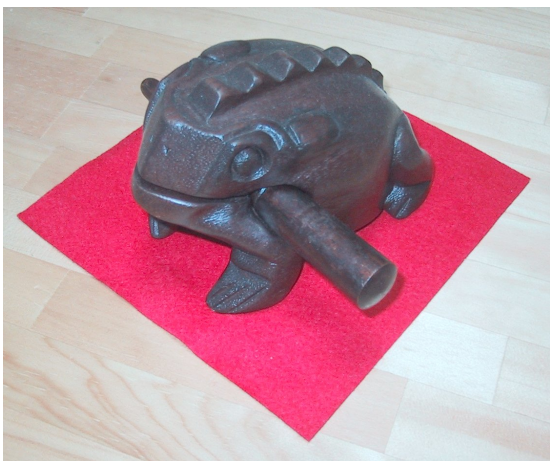
Frog shaped güiro from Japan

This can be a wood, metal or plastic instrument which has ridges on its body. Often known as Güiro, rhythms are created by running a thin stick up and down the ridges at different speeds. Gourds or bamboo have traditionally been used as they have a resonant hollow body and can easily be cut with ridges. A common type from Asia is a carved wooden frog which has ridges cut on its back and its mouth and belly hollowed out.