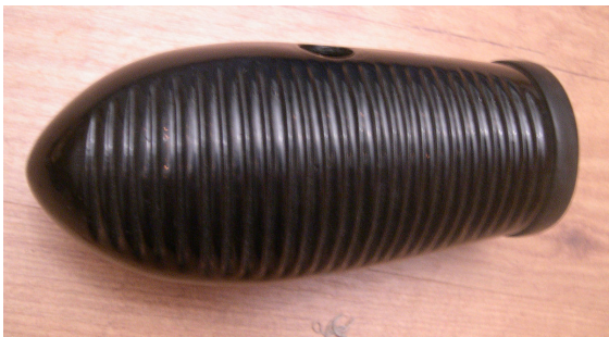
Modern fibreglass güiro from South America

This can be a wood, metal or plastic instrument which has ridges on its body. Often known as Güiro, rhythms are created by running a thin stick up and down the ridges at different speeds. Gourds or bamboo have traditionally been used as they have a resonant hollow body and can easily be cut with ridges. A common type from Asia is a carved wooden frog which has ridges cut on its back and its mouth and belly hollowed out.