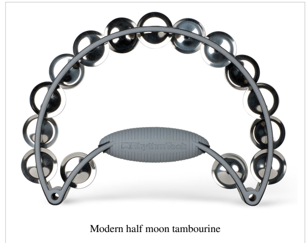
Modern half moon tambourine

Hand percussion is a term used to indicate a percussion instrument of any type from any culture that is held in the hand. They can be made from wood, metal or plastic and are usually either shaken, scraped or tapped with fingers or a stick. It is a useful category in terms of a large percussion orchestra in that it identifies all instruments that are not drums or pitched percussion such as marimba and xylophone.