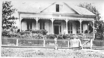
T.H. Armstrong Home & Formal Gardens