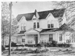
Blackmon-Bennett-Weaver Home— Parade of Homes 1973 & 74