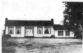
Kennedy-Lampin Home—Parade of Homes 1974